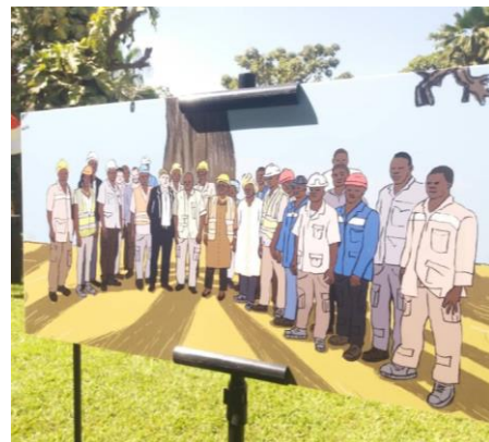
Drawing of the SSPT team

We are proud of our colleagues from Senegal who work hard everyday to achieve the company's objectives and ensure our customers satisfaction!