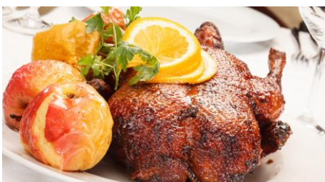
Christmas goose in Germany

You might indulge in mince pies, or perhaps ham is more your style. For others, a holiday meal wouldn't be complete without fried chicken, fruit cake or salted cod. Depending on where you grew up, and where you live now, the seasonal delicacies that grace your table may be sweet, savory, or a little bit of everything in-between.